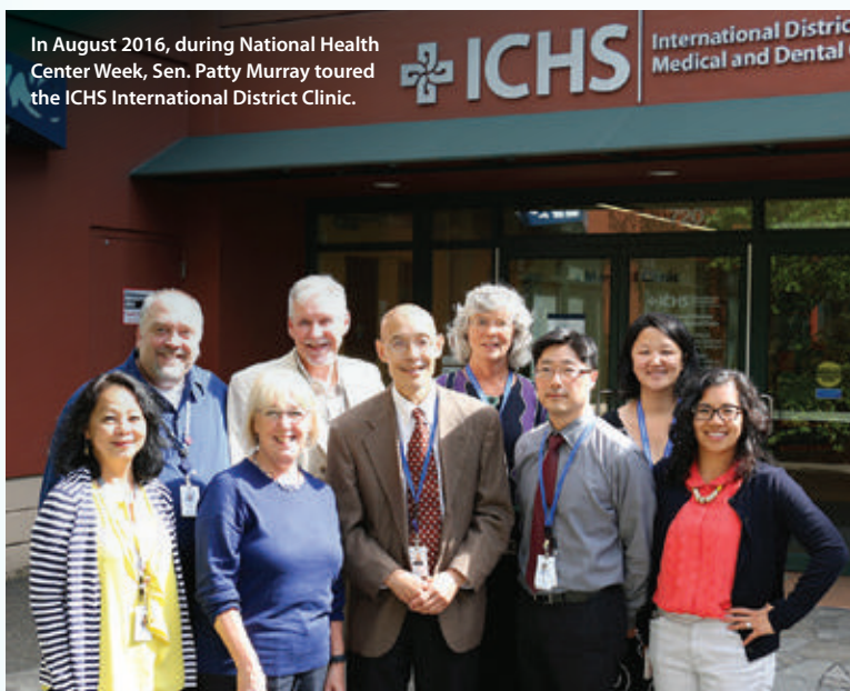
In August 2016, during National Health Center Week, Sen. Patty Murray toured the ICHS International District Clinic.